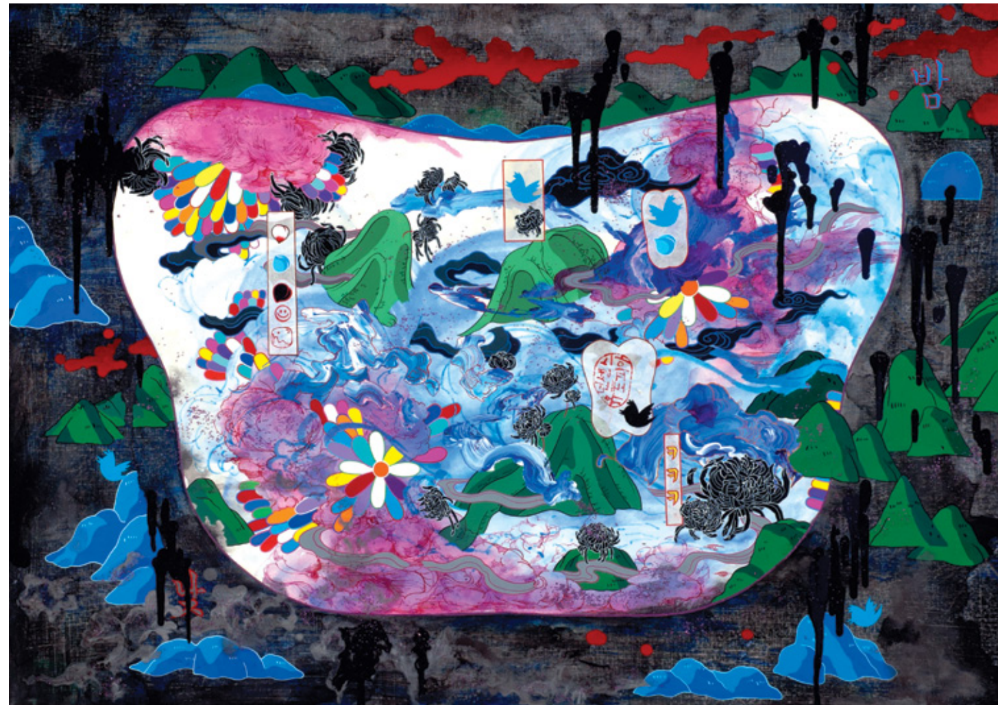
Day for Night I, 2011, 24" x 36", Ink and acrylic on Hanji mounted on panel