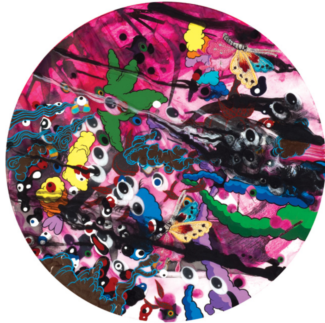
Springfield, 2011, 12" diameter, Ink and acrylic on Hanji mounted on canvas