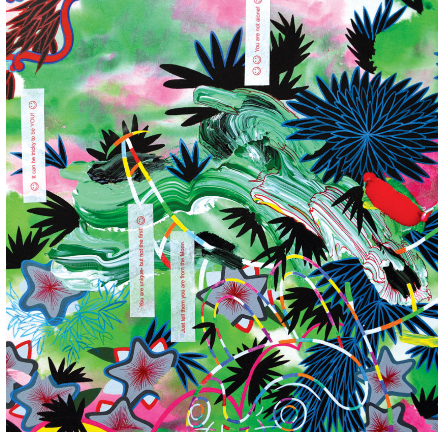
Left: Hideout , 2011, 24" x 24", Ink, acrylic, and fabric on Hanji mounted on canvas. Right: Detail of Hideout .